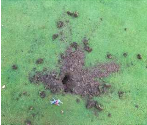
Animal damage on the 5 th Green