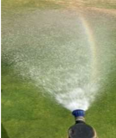
A familiar sight through the summer months. Hand watering areas to ensure we minimise our water usage without compromising playing conditions