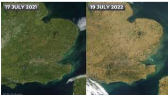
Satellite image of heatwave damage. Although Knighton Heath is just out of view in this image my request for another shot including us was denied